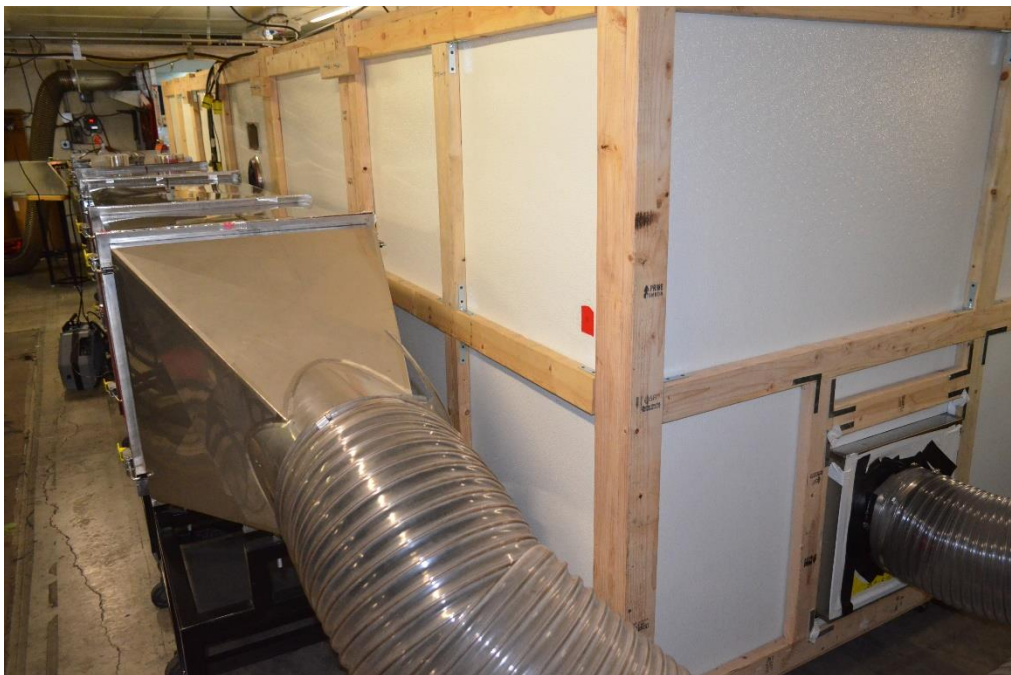
Figure 1. Formaldehyde system setup